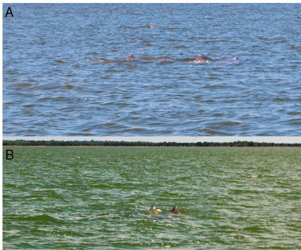
Figure 2. Photographs of manatees at Conil Lagoon during the sightings, 10 (A) in which 5 individuals can be recognized and 11, (B) with 2 individuals (J. G. Ávila-Canto, ‘Manaholchi’).

These increases may reflect positive effects of regional conservation efforts (e.g., the creation of the Manatee Sanctuary in the southern part of the state) or increased levels of anthropogenic pressures in nearby areas where the species was previously common. Díaz-Ortiz, Nourisson, and Castelblanco-Martínez (2014) suggested the increasing number of visitors to the highly touristic Riviera Maya (at approx. 70 km of coastline from Holbox) induced changes in the manatee’s habitat use, which reflected in a substantial reduction of manatee sightings in several areas. Manatees may have shifted their distributions north, although more evidence is necessary to support this idea.